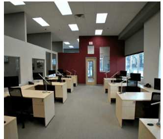
Downtown Windsor Business Accelerator