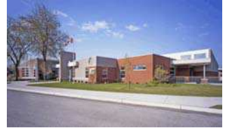
Our Lady of Mount Carmel School

2014 St. Clair College Dog Run Addition, Windsor, ON (.4 mil) 2011 Downtown Windsor Business Accelerator, Windsor, ON (.5 mil) 2010 St. Christopher, OLMC, LA Desmarais School Portables, Windsor, ON (.15 mil) 2010 St. James Catholic School 4 Classroom Addition, Windsor, ON (.9 mil) 2007 University of Windsor New Engineering Building, Windsor, ON (42mil) 2006 CAW Student Centre Green Roof, University of Windsor, Windsor, ON (1.6mil) 2006 Glengarda New Facility / Linen Building Renovation, Windsor, ON (5.5mil) 2004 Our Lady of Mount Carmel 4 Classroom Addition, Windsor, Ontario (1mil) 2006 Best Start Child Care Centres- Four Schools, Essex County (.7mil) 2005 WECDSB Building Envelope Renovations -Four Schools, Essex County(.5mil) 2005 L.A. Desmarais Catholic School Renovations, Windsor, Ontario(.35mil) 2005 Stella Maris Catholic School Addition & Renovation, Amherstburg, ON (.1mil) 2004 St. Gregory Catholic School Entry / Office Addition, Tecumseh, ON (.2 mil) 2004 St. Christopher Catholic School Additions and Renovations, Windsor, ON (5 mil) 2003 Sacred Heart Catholic School additions and Renovations, LaSalle, ON (2 mil) 2003 Our Lady of Perpetual Help Catholic School Addition, Windsor, ON (.5 mil) 2002 Our Lady of Mount Carmel Catholic School, Windsor, ON (4.5 mil) 1999 Rotary Children's Safety Village, Windsor, ON (1.6 mil) 1998 Lakeview Montessori School, Tecumseh, Ontario (.8 mil) 1995 Engineering Building Renovations, University of Windsor (.2 mil)