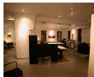
Passa Architects Office