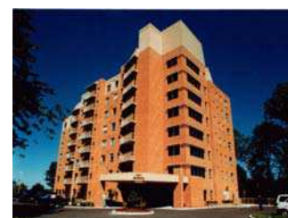
Hofburg Seniors Residence