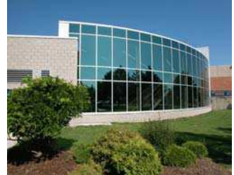
New Fitness Facility Building, U of W