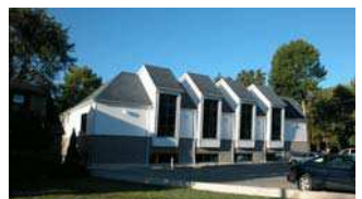
Lakeview Montessori School