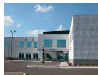
South Walkerville Medical Centre