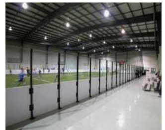
I.C.H.A Sports Complex