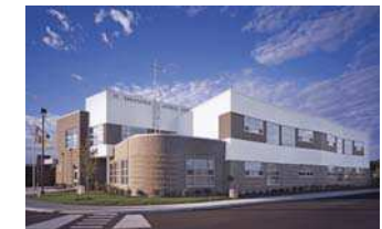
St. Christopher's Catholic School