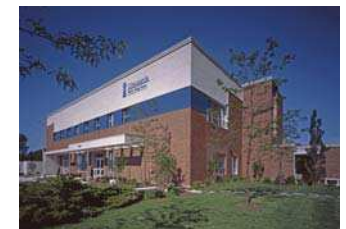
Glengarda New Facility