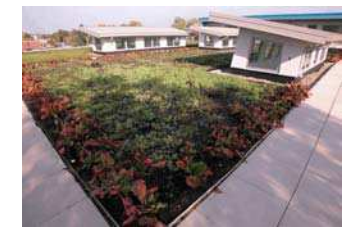
Glengarda's 9,000 SF Green Roof