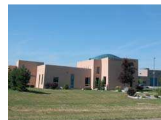
Clairmont Financial Building