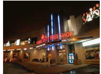
Windsor Tunnel Duty Free Shop