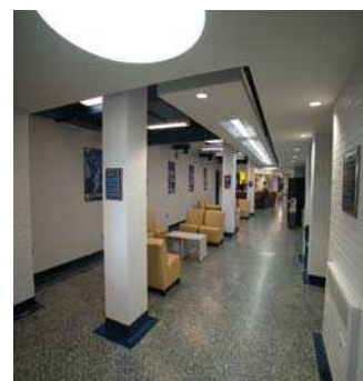
St Denis Athletic & Community Centre