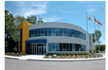
Sterling Fuels New Administration Building & Warehouse