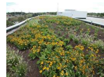
St. Christopher's 5,000 SF Green Roof