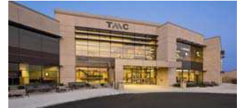
Tecumseh Medical Centre

1994 - Present Founder, Passa Associates Inc., Architects 1994-97 Founding Partner, Aleo / Passa Associates, Windsor, Ontario 1990-94 Founding Architectural Partner, R. Meo & Associates, Windsor, Ontario 1987-90 John G. Hreno Architect, Windsor, Ontario 1985-86 Philip Cox & Partners Architects, Sydney, Australia 1982-85 Avery & Leuschke Architects, Auckland, New Zealand 1982 Peddle, Thorpe & Aitken Architects, Auckland, New Zealand 1981 Murray, Murray, Griffiths & Rankin Architects, Ottawa, Ontario 1976-80 Stevens, Graham, McConnell, Milton, Partners, Calgary, Alberta