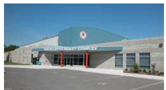
I.C.H.A Sports Complex